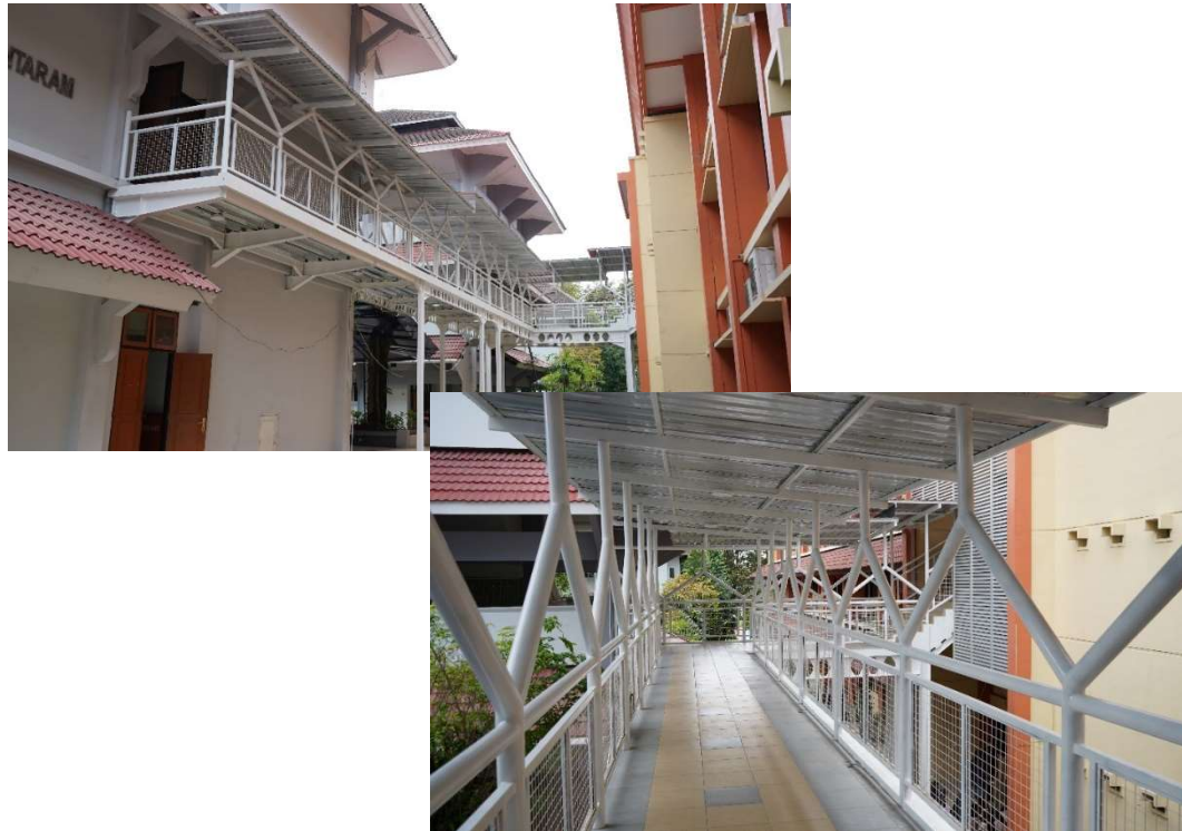
Picture 3. Photo of the Doorloop that connects the 2nd floor of the WS Rendra Building, the Ki Ageng Suryomentaram Building, and the R.Ng. Ranggawarsita Building.