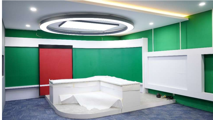
Picture 2. DKV Learning Broadcasting Room on the 2nd Floor of the Prof. Building. Dr. (HC) Amri Yahya

The faculty also develop the infrastructure used to support lecture activities, especially in the field of broadcasting. The faculty developed a broadcasting room in the Prof. Dr. (HC) Amri Yahya Building Floor 2 for learning Visual Communication Design (DKV). The development of this facility is also to support the existence of the DKV Study Program in the future.