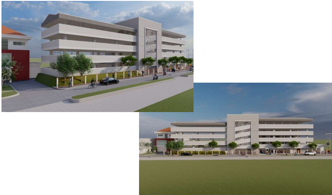
Picture 4. UNY Integrated Parking Lot Development Plan UNY Year 2023–2024

out on the east side of the Moh Building. Yamin (Academic Service Centre/ PLA), namely by adding an elevator to support all faculty activities. The following is a design of the work that will be carried out to develop facilities at FLAC UNY.