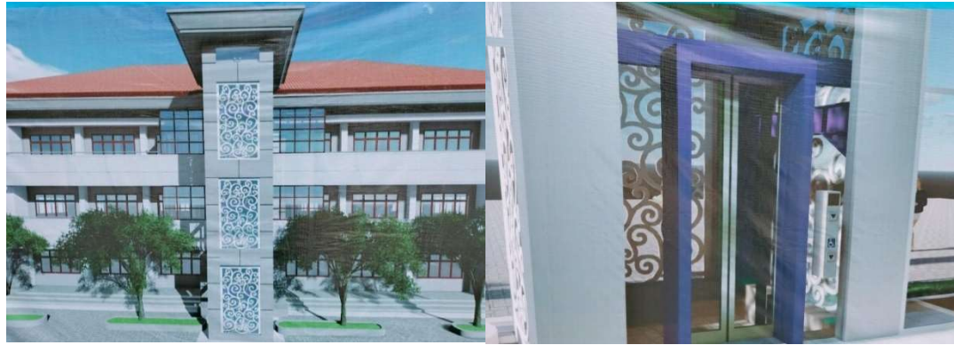
Picture 5. Procurement of Elevators for Moh's Building. Yamin is running.