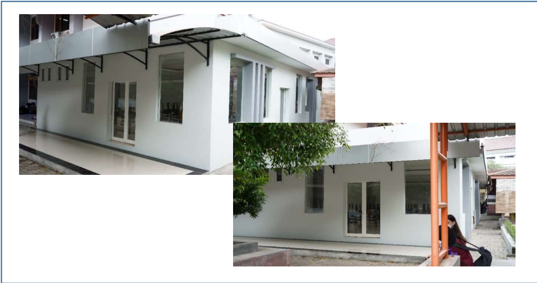
Picture 3. UNY FLAC Resto Ungu Canteen Facilities

In 2022, the faculty also developed a connecting doorloop between buildings on the 2nd floor, which connects the WS Rendra Building to the Ki Ageng Suryomentaram Building and the R.Ng. Ranggawarsita Building. The development of this facility was carried out with the aim of making it easier for students, staff, lecturers and other users to move between connected buildings so that they do not have to go up and down to each building first.